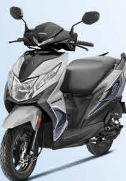
PEARL IGNEOUS BLACK + PEARL DEEP GROUND GRAY